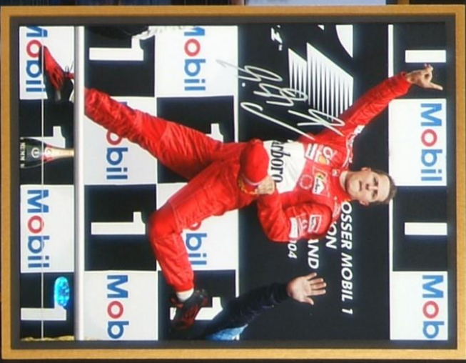
MICHAEL SCHUMACHER 7-time World Champion 1st in 5 seasons (1995-1999) "Considered the greatest driver to ever live"