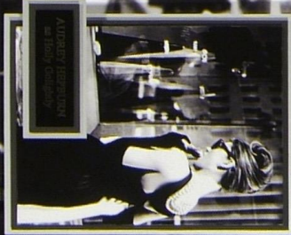
Audrey Hepburn in 'Breakfast at Tiffany's'