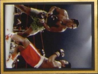
"Frazier (left) knifes Frazier on his knee. Biggest of his career which he refused to take." - Muhammad Ali